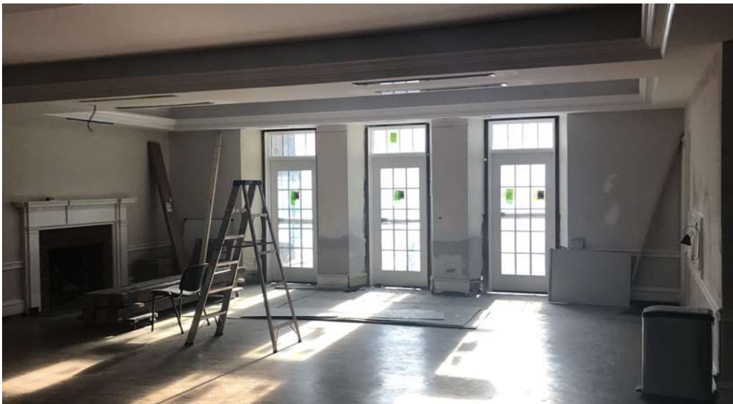
The kitchen door, attracted by all this activity, migrates toward the Assembly Room.