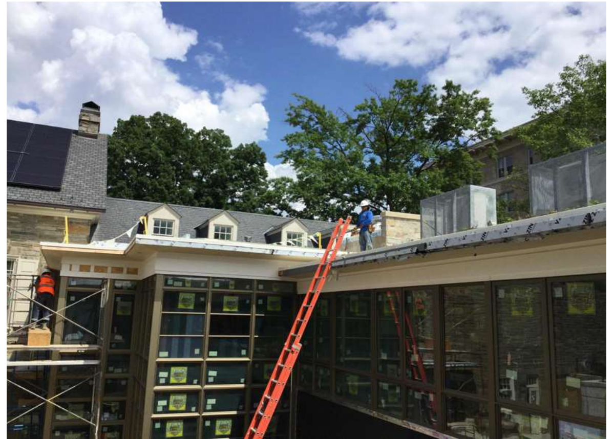
Three electricians continue fire alarm rough-in.