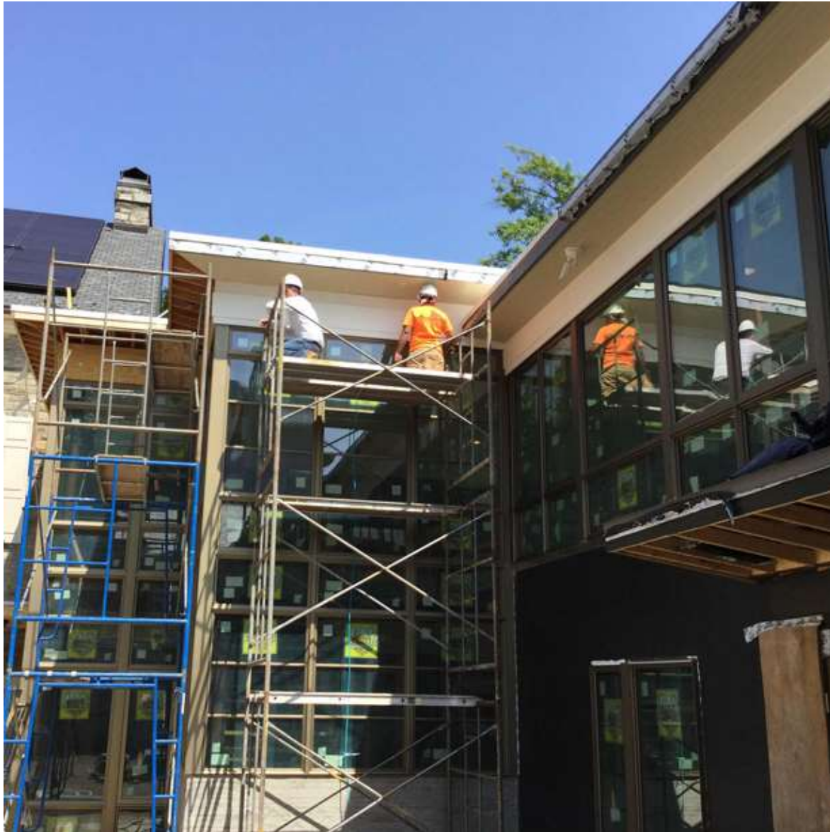
Four roofers work on fascia and gutters.