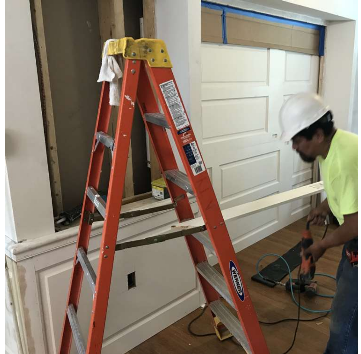
Also notice that the new Parlor pocket doors (which turned out to be too tall) have been installed sideways to provide a temporary barrier while the work proceeds.