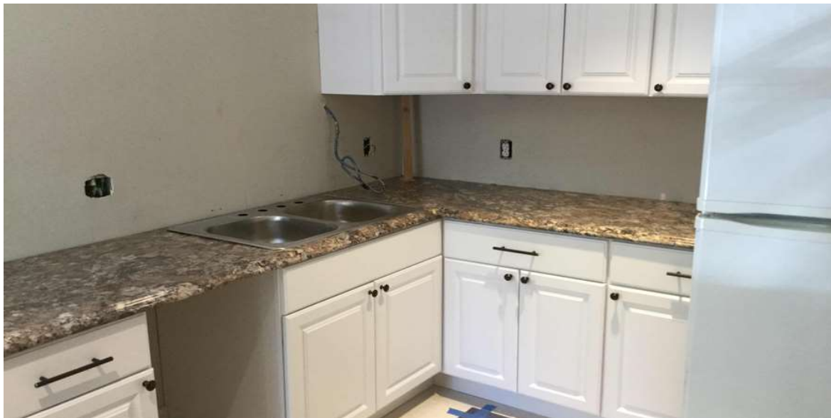
And another in the kitchenette.