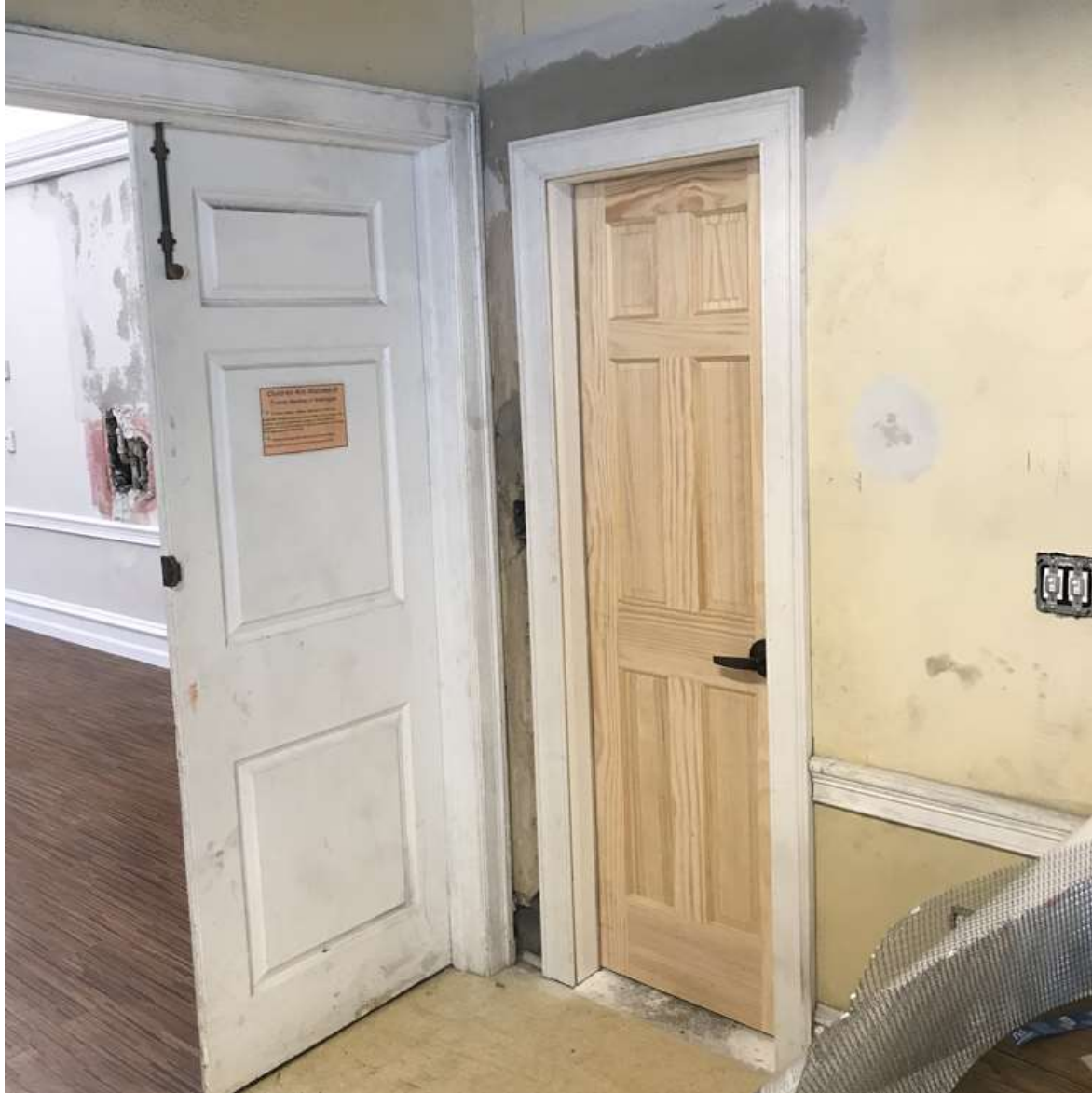
A new door in the North Room, leading to the mini-bathroom.