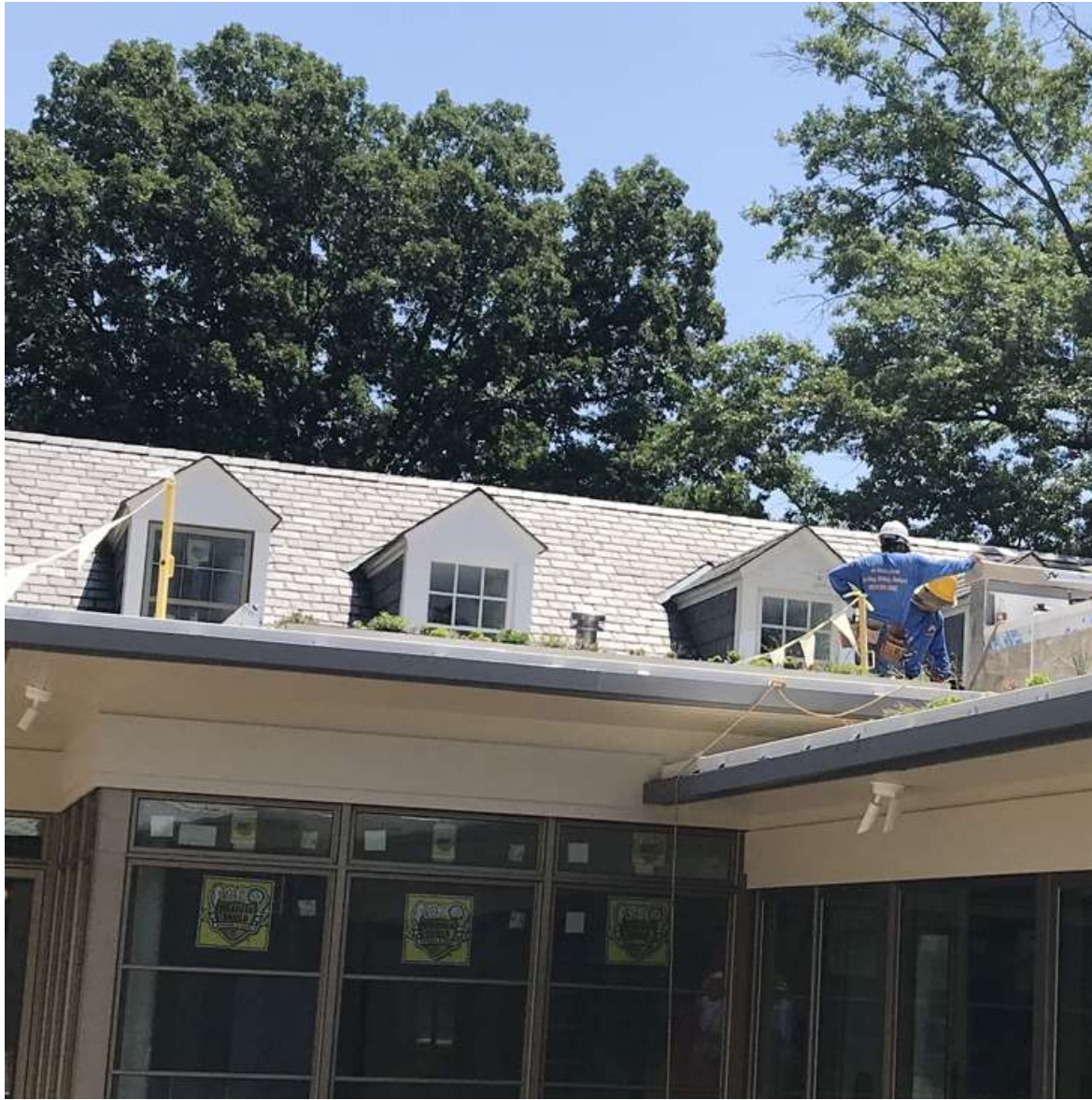
Roofers work on flashings and downspouts.

And a new attic window for easier access to the green roof and other rooftop attractions.