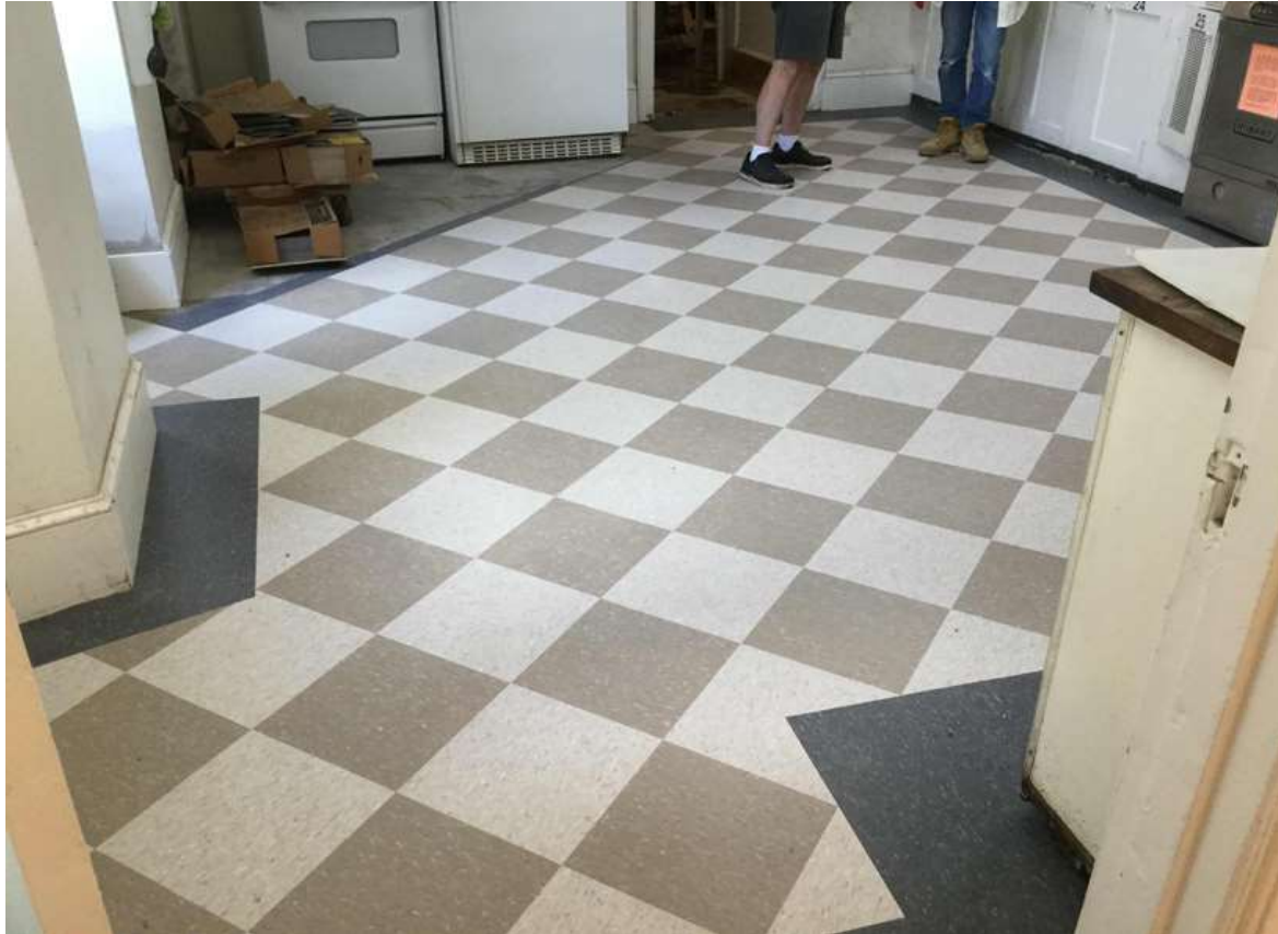
A flooring crew lays down vinyl tile in the kitchen.